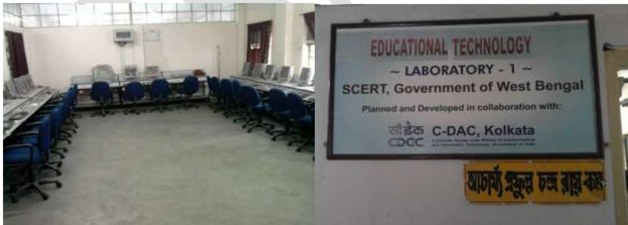
Education Technology Laboratory

At their worst these kinds of computer laboratories lie in disuse, with problems of maintenance and low interest or capacity amongst students and teachers to use them effectively. This is the case with many schemes for IT enablement in government schools in India and other South Asian countries. However at their best in select private schools (Beaconhouse Schools in Pakistan) these laboratories serve as resource centres providing an opportunity for students to use them effectively for enhancing their understanding of concepts and having access to an array of learning materials.