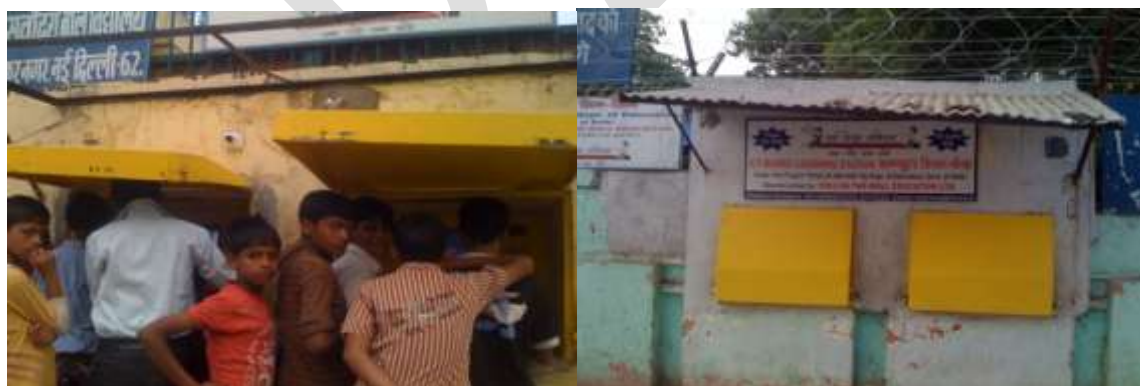
NIIT, Hole-in-the-Wall Learning Station