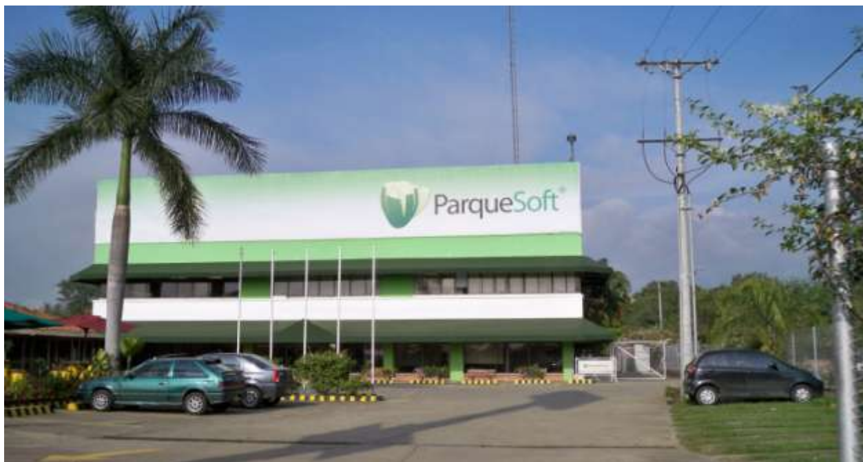
ParqueSoft Cali, October 2008