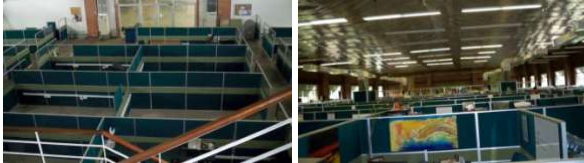
Cali ParqueSoft cubicles. Enterprises take space in an open floor plan of cubicles with desk space. The open space system allows for continuous informal exchanges within and across each enterprise.